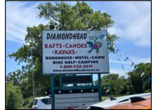
Diamondhead Resort is located off Hwy 10

Three cabins are on-site too with one which sleeps 12 for $340.00 per night weekends, $315.00 per night weeknights. A cabin which sleeps 2 for $255.00 per night weekends, and $225.00 per night weeknights. A cabin which sleeps 10 for $430.00