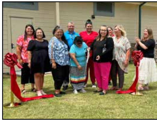
HLDCDC ribbon cutting of the grand opening of their expansion.