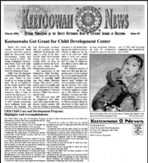
March 2004 article on receiving grant money for HLDCDC.

Be sure to check out the Diamondhead Resort website, https://diamondheadresorts.com for more information regarding floating, camping, festivals and entertainment. For booking call, 800-722-2411.