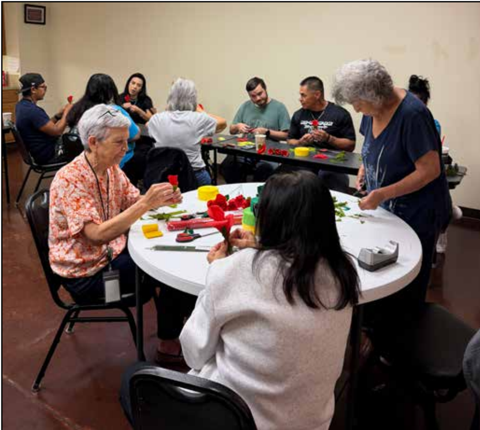
Members of Echota Behavioral Health's Prevention Team make paper roses to carry in the Keetoowah's MMIP Walk.

Staff and volunteers from Echota Behavioral Health's Prevention Team and volunteers at the John Hair Cultural Center and Keetoowah Museum came together the last week of April to make paper flowers, which were carried by employees in the Missing and Murdered Indigenous People Walk at the UKB Tribal Complex.