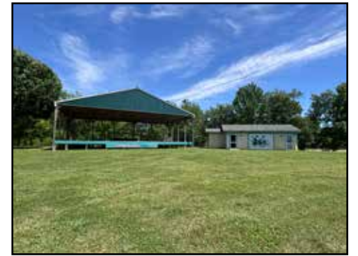
Festival grounds at Diamondhead for Terp Float and Diamondstone.

per night weekends, and $400.00 per night weeknights.