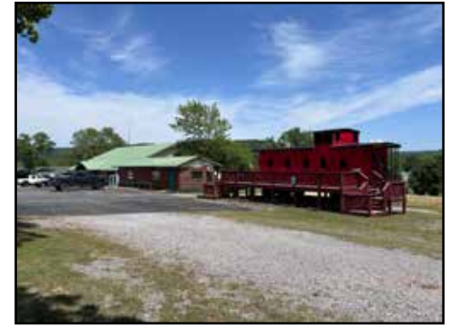
The Keetoowah Company has been tribally operated since 2025 but has been in business for about 40 years.