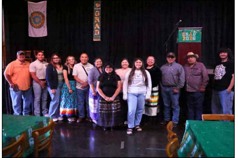
UKB Council celebrated the Keetoowah graduates on their accomplishment.