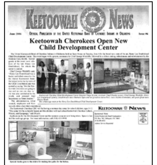
June 2006 article on HLDCDC open house.

Under the direction of Gourd and Kirk the program has grown with HLDCDC having a site manager, currently in that position is Shirlene Proctor. The center has expanded and made improvements from 6 classrooms to 8 classrooms, the playgrounds have been remodeled adding