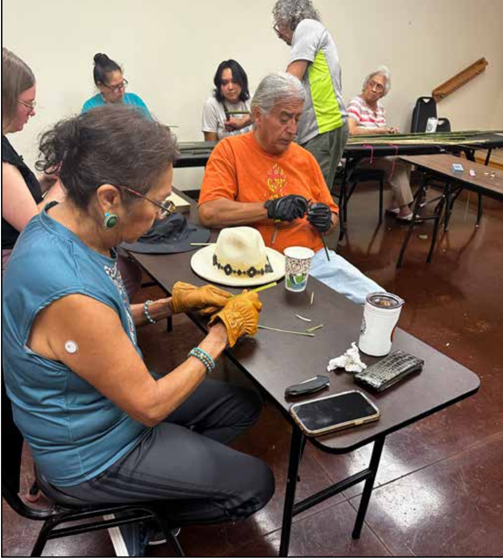
Class members peel river cane to make basket strips.

For more information, contact the Tribal Historic Preservation office at 918-871-2826.