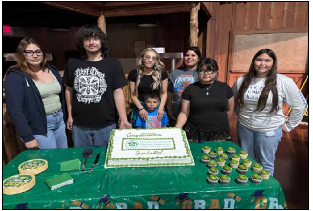
Seven Keetoowah graduates celebrated with friends and family.