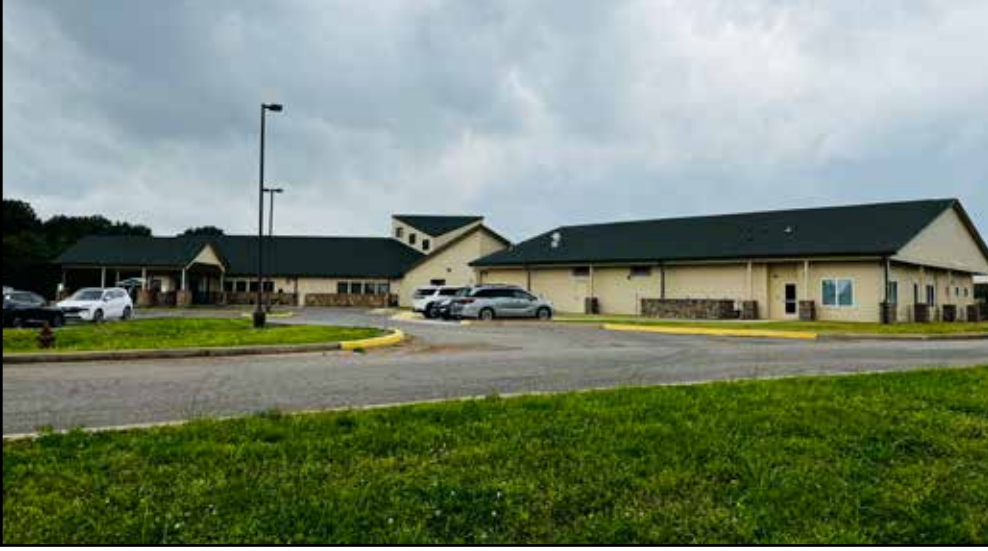
Henry Lee Doublehead Child Development Center

Tahlequah's Best Daycare continues to serve the children since 2006