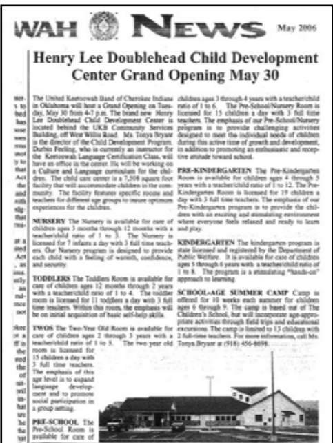
May 2006 article on HLDCDC grand opening.